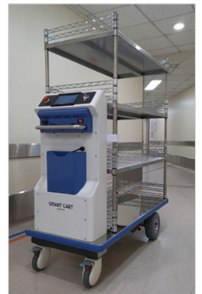
<Seoul University Hospital>