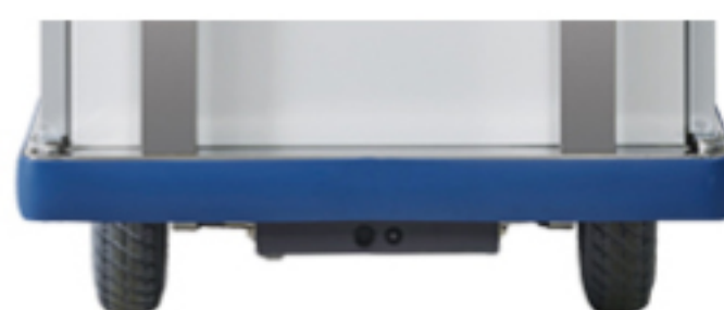
Rear Detection Sensor